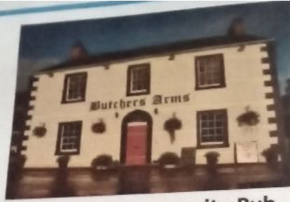
Lyvennet Community Pub Crosby Ravensworth, CA10 3JP