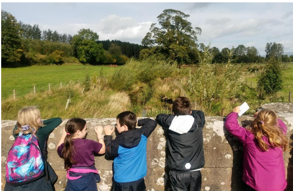
Children look down at a tributary of the River Lyvennet in the village. During sessions with Eden Rivers Trust, they helped relocate native British Crayfish into a new meandering section which was developed to help the county's flood defences.