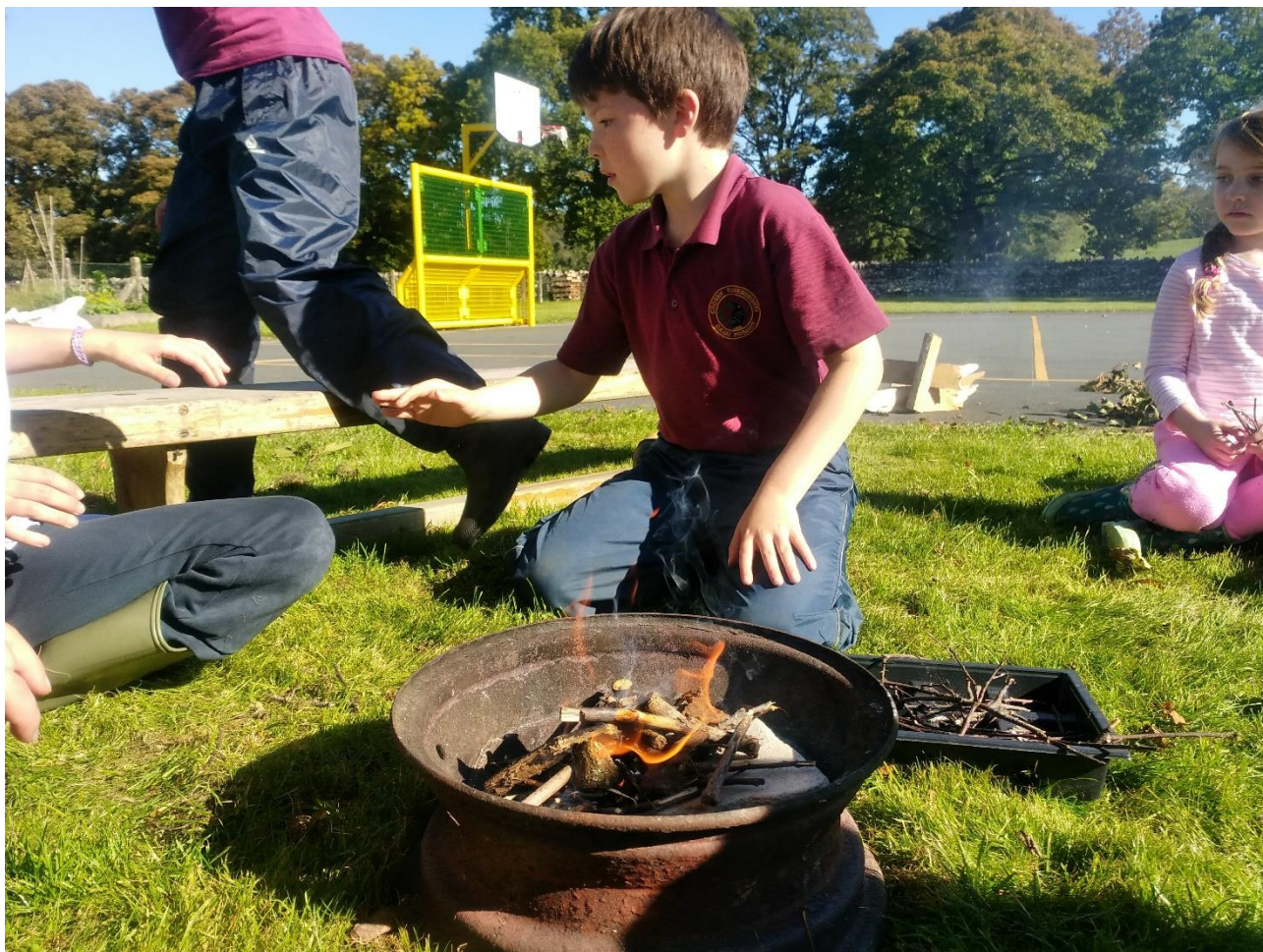
Children enjoy our weekly outdoor learning classes together.