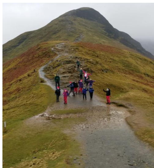
Pupils from Years 5 and 6 on Outdoor residential at Hawse End, Keswick