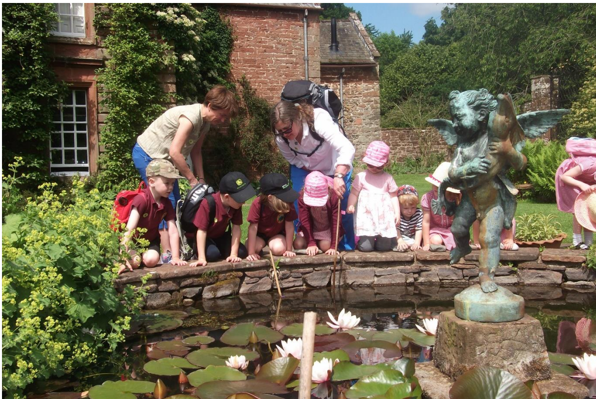
Class 1 exploring their gardens topic.