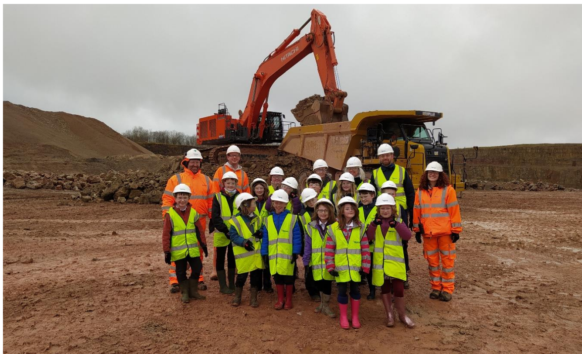
Children visiting nearby Shap Quarry to watch a live explosion of limestone

We're small. That's what's so special about us. We've a magical atmosphere in our church school which is hard to describe - like one big happy family.