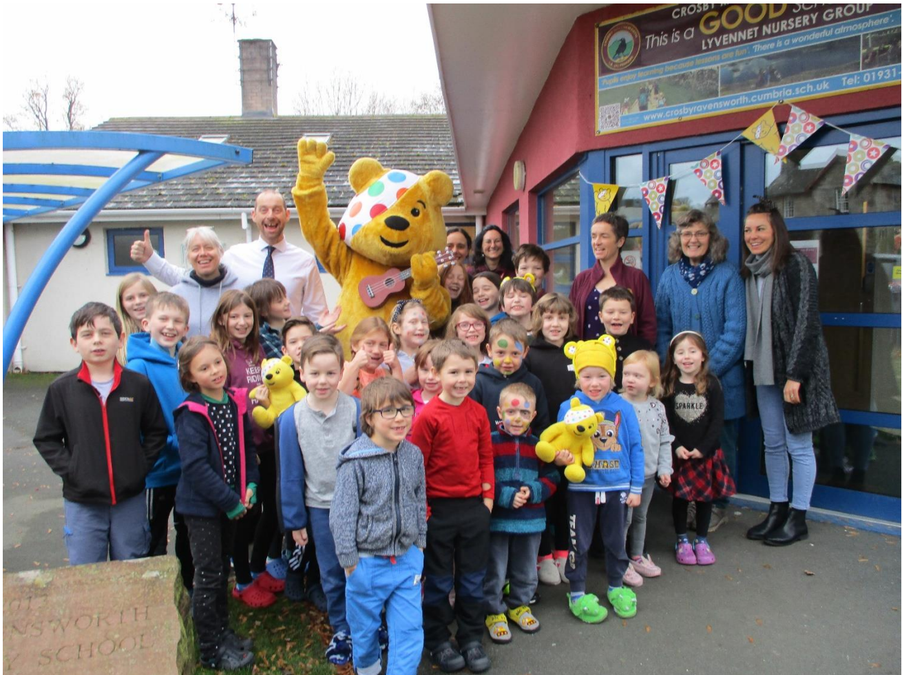
Children celebrate Children in Need Day with Pudsey Bear

There is a “snowball” scheme to allow schools to quickly spread information which affects the security of schools in the local area (eg strangers acting in a suspicious way), and there are also arrangements for getting all the children back into the school building in an emergency.