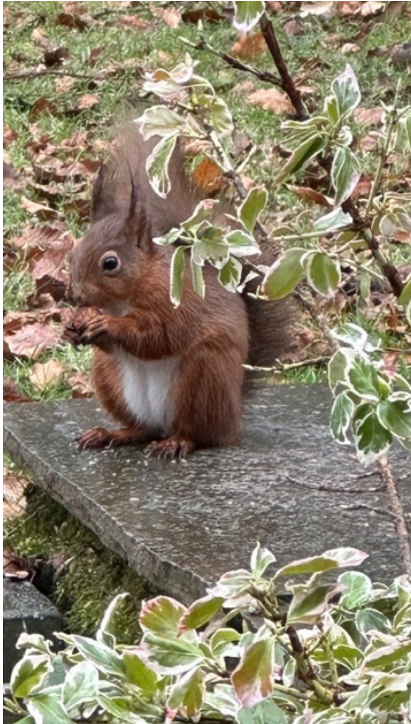
Reagill

And then below are details of a P&DRSG event that is taking place at Shap Wells during May.