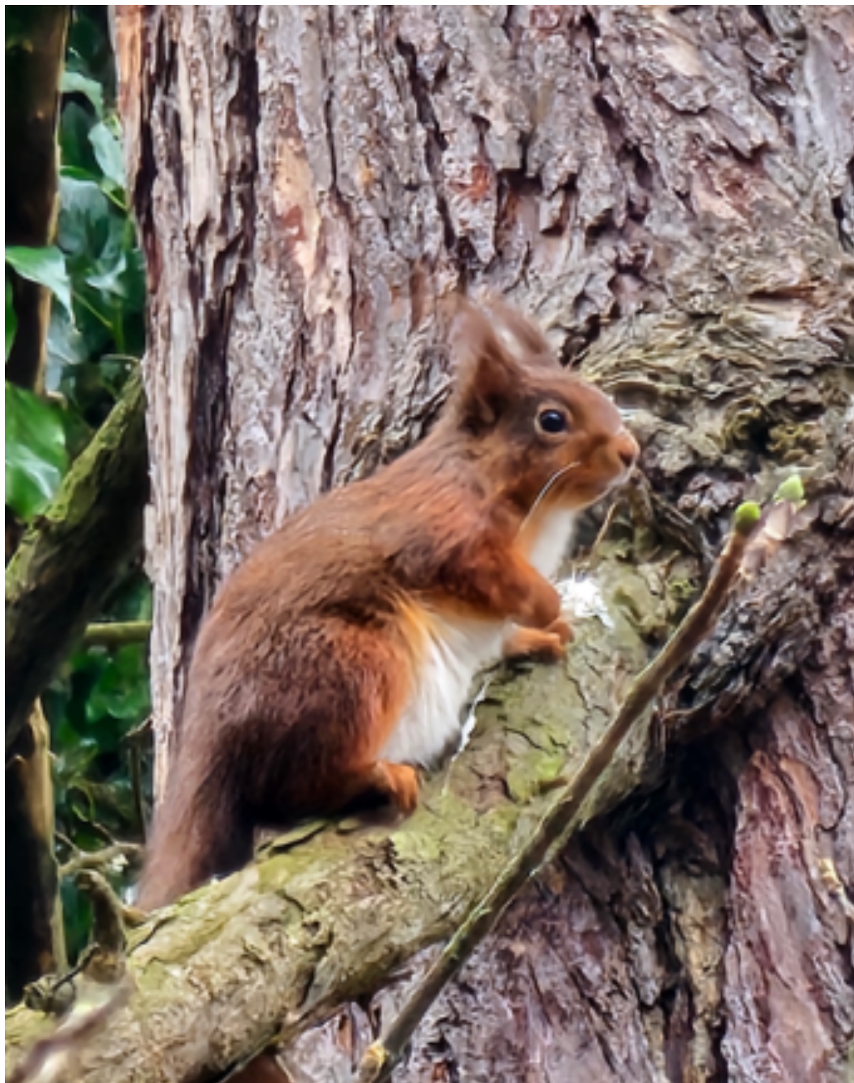
Little Cliburn Wood