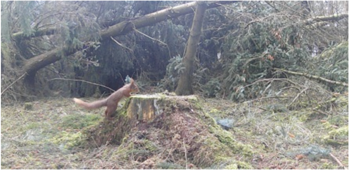
Allan's Ling Wood, Crosby Ravensworth

A little update on all things squirrel – generally things are OK with any greys tending to be quickly dealt with(*).