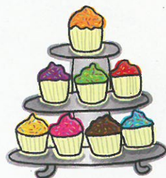
Cupcake tree: £48