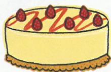
Baked cheesecake: £23

A bakery produces a variety of cakes to sell each day. Answer these questions about their products.