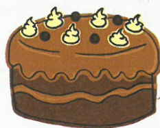
Chocolate gateau: £36